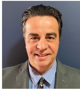
Mayor Ken Peterson

Speaking of information, please visit our Village website, our YouTube channel and Facebook page for the most recent information about current events happening in our town. You should also sign up for Code Red, our emergency notification system. We use that system to provide important information on an expedited basis to our residents.