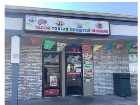
Boyos Market and Taqueria