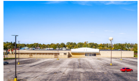
Empty Kmart Building

sell the building to an appropriate business at a reasonable price.